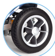
Stylish silver wheel hubs