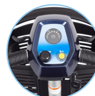
User friendly controls