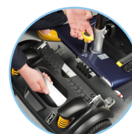
Super easy split mechanism