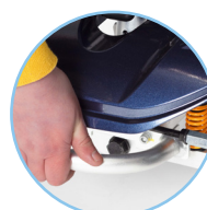
Front impact bar / carry handle