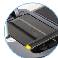
Lightweight lithium batteries