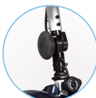
Angle adjustable tiller