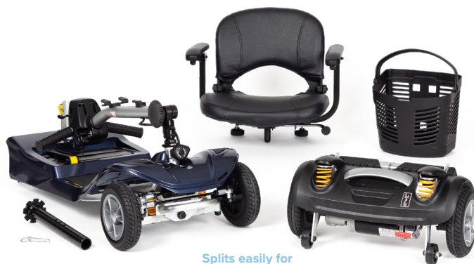
Splits easily for transportation